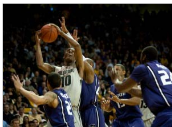
Freshman guard Alec Burks attempts a shot at the basket during CU's game against Kansas State on Saturday at the Coors Events Center. The Buffs lost to the Wildcats 87-81.